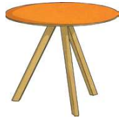
seats 5 people