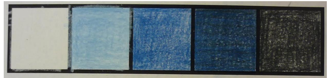
Blending and mixing with another colour, or with black.